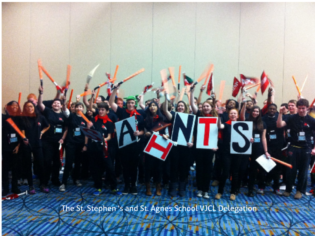
The St. Stephen's and St. Agnes School VJCL Delegation